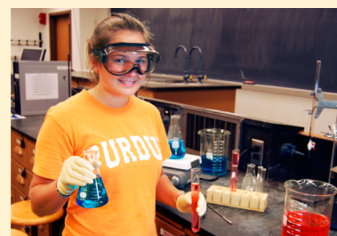
What are our faculty goals for the undergraduate chemistry laboratory?